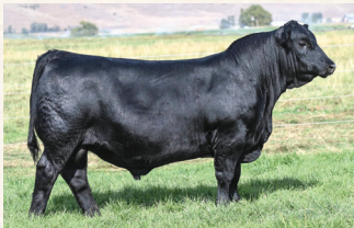
Coleman Platinum 2622 Sire of Embryos