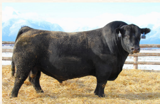
Coleman Charlo 0256 Sire of Embryos

Coleman Donna 7231 is one of my very favorite daughters of 714 we have ever had. She resembles her mother more than any other daughter we have ever had. She is a tick stouter than Donna 714. She was a female that I never wanted to sell, and if it were not for our complete dispersal of our summer calving unit in 2023, we would not have sold half interest in her. 7231 is a Pathfinder female who has a calving interval of 366 days on her first five calves and a progeny production record of BR 5/96, NR 6/107, and YR 6/105. She has a perfect udder, very long-spined, perfect feet and very wedge-shaped. Sire of these embryos is Charlo 0256. No other sire in history of the Angus Breed combines proven calving-ease with his degree of thickness, fleshing-ability, and authentic Angus Breed character. Charlo is a large scrotal, highly fertile sire with superior semen quality. Charlo was breeding naturally at 10 years of age; you can see the same qualities in the longevity of his daughters. Charlo sons are still topping sales across the country. These are IVF embryos (Trans Ova), and we are selling three embryos in this mating and guaranteeing one pregnancy. The buyer has the option to take 6 embryos out of this mating, and we will guarantee 2 pregnancies. These embryos have been sexed for females, 90-95% accurate. These embryos are exportable to Canada.