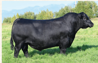
Hummel Palermo SA Sire of Embryos

She has been a standout since birth. 1439 has done a very nice job on her first two calves, BR 2/98, NR 2/105, and YR 1/107. "1439" is extremely long, deep sided, extremely good feet, with a big hip in her. The combination of Rock 7200 and C815 has been one of the very best matings on C815. Flush brothers to "1439" were features in our 2023 bull sale and sold to registered operations in Idaho and Texas. Palermo is an outcross sire who has caught the attention of cattlemen around the world. He sold for $175,000 for 1/3rd interest in our 2024 Spring Bull Sale, for a valuation of $525,000. He has been a visitor favorite here the past couple of years, with many telling us, "He's as of a bull as we've seen in a long time." He is as impressive of a bull as you will find with Angus breed character, tremendous depth of body, perfect feet and structure with a huge, wide hip and muscle expression. Palermo sired two of the best bulls we have ever made here in Program and Authentic. His daughters may be the best part of him; they are as impressive of a set as we have ever made here out of one sire. These will