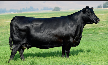
Coleman Eriskay 291 Dam of Embryos