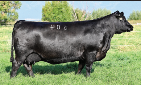
Coleman Donna 504 Dam of Embryos

Coleman Donna 504 x Coleman Avalanche 487