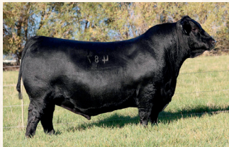
Coleman Avalanche 487 Sire of Embryos