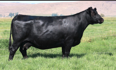
Coleman Donna 5207 Dam of Embryos

Coleman Donna 5207 x Coleman Maternal Balance3734