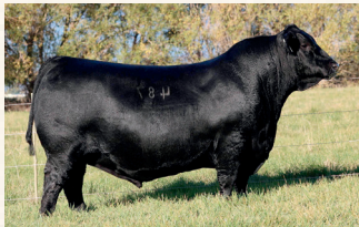
Coleman Avalanche 487 Sire of Embryos

Coleman Donna 1448 has been a favorite on the ranch since she was a young calf. 1448 has acquired the nickname "Madonna" and has always been a visitor favorite! She sold one-half interest for $120,000 for a $240,000 valuation in the 2023 Your Maternal Source Female Sale to Ingram Angus of Tennessee. 1448 recorded a BR of 88 and WR of 102 on her first calf while staying in excellent shape and maintaining a perfect udder. She is a female that gets better as she ages, with a massive amount of rib shape and stoutness for a two-year-old nursing her first calf. Coleman Avalanche 487 has been a personal favorite from his calf crop with the potential to be a major breeding force. Avalanche has created quite a stir selling for $250,000 for ½ interest to Montana Ranch and Canadian sires for a valuation of $500,000 in our recent "Your Maternal Source Sale" in October. Semen on Avalanche has been in very high demand and has sold very well. Avalanche is a performance and maternal trendsetter with tremendous length, added style, and herd bull presence as well as phenomenal depth of body, spring of rib, and stands on excellent feet. We are starting to get our first calves out of Avalanche, and they are exceptional, very exciting times! Avalanche had a scrotal of 39 as a yearling bull and froze extremely high-quality semen right out of the gate. We have used Avalanche very heavily this spring,