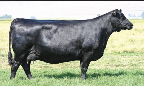
Coleman Donna 7231 Dam of Embryos

Coleman Donna 7231 x Coleman Maternal Balance3734