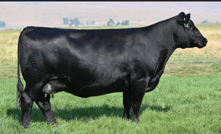
Coleman Donna 9209 Dam of Embryos

Coleman Donna 9209 x Coleman Maternal Balance3734