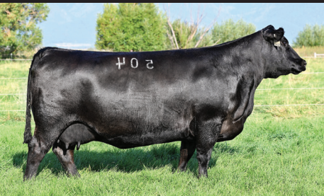
Coleman Donna 504 Dam of Embryos