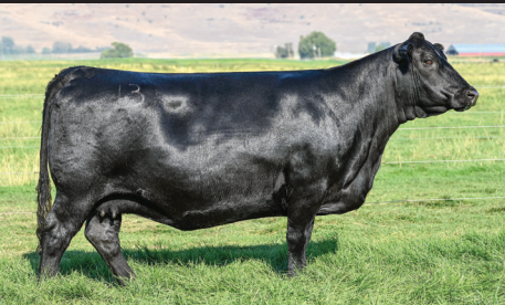
Mill Brae Iden Geroginia 4086 Dam of Embryos

Mill Brae Iden Georgina 4086 x Coleman Program 593