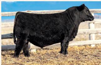
Coleman Program 593 Sire of Embryos

Coleman Donna 046 is a Pathfinder female and a flush sister to Glacier 041. She records a progeny production record of BR 4/97, WR 4/108, and YR 2/111. 046 and her flush sisters are some of the most sought-after females in the program. 046 was a highlight in our 2022 Your Maternal Source female sale, selling one-half interest to Ingram. Angus for $120,000. We very seldom sell embryos out of 046, so pay attention here. 046 will be a big part of the future here at Coleman Angus. 046 has a perfect udder, extremely good on her feet, big, long square hipped, with a tremendous look. Coleman Program 593 is owned with Schaff Angus Valley of St. Anthony, ND, KT Ranches in Canada and Canadian Sires and Donors in Canada. Program is the $270,000 top-selling bull of the 2026 Coleman. Angus Spring Bull Sale where he captivated cattlemen from all over the world. He is a son of the outcross sire, Palermo, back to the Pathfinder dam, Coleman Donna 787. He is as good as we have ever produced at Coleman. Angus for phenotype, power, mass, structural correctness, body dimension, and has a flawless stride when in motion. We have not produced an individual that has this kind of three-dimensional shape from front to rear with as explosive of hip structure and width from behind. His Pathfinder dam has generated $1,687,000 on 27 head in past Coleman Angus sales. A full sister was the $150,000 valued second top-selling heifer calf of the 2025 Your Maternal Source