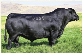
Coleman Rock 7200 Sire of Embryos