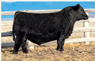
Coleman Program 593 Sire of Embryos

Coleman Echo 122 has a progeny production record of BR 2/102, WR 2/108, and YR 1/108. "122" is a beautiful female, visitors here have loved her. Coleman Echo 122 was the $26,000 one-half interest highlight of our 2023 Your Maternal Source Sale going to Circle K Farms of TN. She is a direct daughter of the record-selling Coleman Bravo 6313 back to PM Echo 8'16. Her dam is a famous cow in Canada who was selected as the 2017 Canadian Agribition Reserve Grand Champion Female, the 2018 Canadian Agribition Grand Champion Female, and the 2018 RBC Supreme Champion. Coleman Program 593 is owned with Schaff Angus Valley of St. Anthony, ND, KT Ranches in Canada and Canadian Sires and Donors in Canada. Program is the $270,000 top-selling bull of the 2026 Coleman Angus Spring Bull Sale where he captivated cattlemen from all over the world. He is a son of the outcross sire, Palermo, back to the Pathfinder dam, Coleman Donna 787. He is as good as we have ever produced at Coleman Angus for phenotype, power, mass, structural correctness, body dimension, and has a flawless stride when in motion. We have not produced an individual that has this kind of three-dimensional shape from front to rear with as explosive of hip structure and width from behind. His Pathfinder dam has generated $1,687,000 on 27 head in past Coleman Angus sales. A full sister