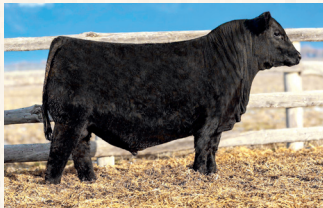
Coleman Program 593 Sire of Embryos

Coleman Chloe 302 is one we are really excited about. Very seldom do we flush females this young but feel she has the potential to run with her mother. Chloe 302 weaned her first calf with a BR of 96 and WR of 119 and bred back AI for her 2nd calf. 302's first calf is a bull sired by Glacier and he has the look and potential to be a major herd-sire candidate. Here is your opportunity to get ahead of the crowd on some of the freshest genetics we have ever offered here in our embryo auctions. Coleman Program 593 is owned with Schaff Angus Valley of St. Anthony, ND, KT Ranches in Canada and Canadian Sires and Donors in Canada. Program is the $270,000 top-selling bull of the 2026 Coleman Angus Spring Bull Sale where he captivated cattlemen from all over the world. He is a son of the outcross sire, Palermo, back to the Pathfinder dam, Coleman Donna 787. He is as good as we have ever produced at Coleman Angus for phenotype, power, mass, structural correctness, body dimension, and has a flawless stride when in motion. We have not produced an individual that has this kind of three-dimensional shape from front to rear with as explosive of hip structure and width from behind. His Pathfinder dam has generated $1,687,000 on 27 head in past Coleman Angus sales. A full sister was the $150,000 valued second top-selling heifer calf of the 2025 Your Maternal Source