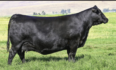
Coleman Donna 8146 Dam of Embryos

Coleman Donna 8146 x Coleman Glacier 041