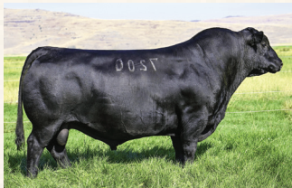
Coleman Rock 7200 Sire of Embryos

been sexed for females, 90-95% accurate. These embryos are exportable to Canada.