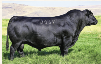
Coleman Rock 7200 Sire of Embryos