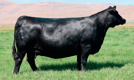
Coleman Chloe 1439 Dam of Embryos