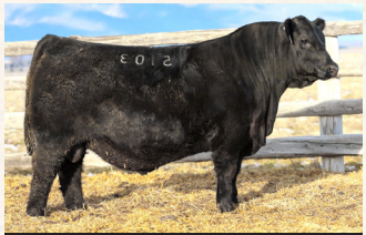
Coleman Authentic 5103 Sire of Embryos