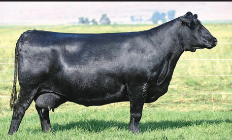
Coleman Donna 5309 Dam of Embryos

Coleman Donna 5309 x Coleman Program 593