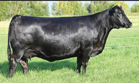
Coleman Donna 046 Dam of Embryos