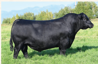
Hummel Palermo SA Sire of Embryos

B ar-E-L Bride 28C is sired by Bar-E-L Natural Law 52Y and is considered by many to be his greatest daughter. 28C headlined the 2022 Open Book Invitational at Brooking Angus Ranch in Canada and became the top-selling female. of the event. She sold a $75,000 flush in the 2023 Your Maternal Source Female Sale and has created quite a stir at Coleman Angus with visitors who saw her. 28C reads with an exquisite phenotype, beautiful udder, massive rib. shape, and a beautiful, elegant front-end extension in a very complete, fault-free, high-quality package. It is very. seldom that we buy outside genetics unless we feel they can move our program, but 28C fits the mold and style we love here! Palermo is an outcross sire who has caught the attention of cattlemen around the world. He sold for $175,000 for 1/3rd interest in our 2024 Spring Bull Sale, for a valuation of $525,000. He has been a visitor favorite here the past couple of years, with many telling us, "He's as of a bull as we've seen in a long time." He is as impressive of a bull as you will find with Angus breed character, tremendous depth of body, perfect feet and structure with a huge, wide hip and muscle expression. Palermo sired