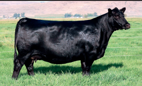
Coleman Donna 1448 Dam of Embryos

Coleman Donna 1448 x Coleman Program 593