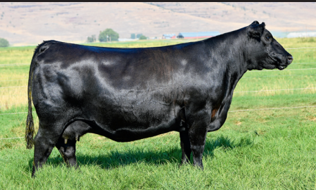
Coleman Chloe 9275 Grand Dam of Embryos

Coleman Chloe 331 x Coleman Authentic 5103