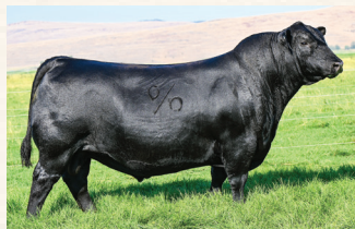
Coleman Glacier 041 Sire of Embryos

Coleman Chloe 412 was the highest selling heifer calf in our 2024 Your Maternal Source Sale, selling for $152,500 for one-half interest. Chloe 9275 her dam is quickly becoming a visitor favorite and has had as much impact on Coleman Angus as any female we have ever owned. "412" is stunning from every angle, extreme amount of rib shape, muscle, fore-rib, and flank, with a great look. This mating is one we are very excited about and would offer the freshest genetics we have ever offered. We have found the combination of the Donna's and the Chloe's here has been a golden cross. Coleman Glacier 041 is currently the #1 bull for $M in the whole breed that has daughters in production. Glacier will improve foot quality, udder quality, fertility, disposition, structure, while also being extremely sound, athletic, and possessing a great herd bull look. We feel he is the bull the industry has been looking for! His daughters here are as good as we have ever had the opportunity to work with. We have 3 flush sisters to Glacier here at the Ranch and every one of them is Pathfinders: they have perfect udders, great feet and are stout with a beautiful look. Every one of these sisters have a great production record, perfect calving interval record, probably as good of set of flush sisters as we have ever had here. We believe it all starts with the mother cow, and Glacier's Pathfinder dam is no exception. 439