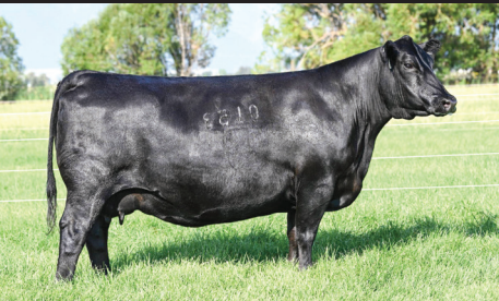
Coleman Donna 0153 Dam of Embryos

Coleman Donna 0153 x Coleman Program 593