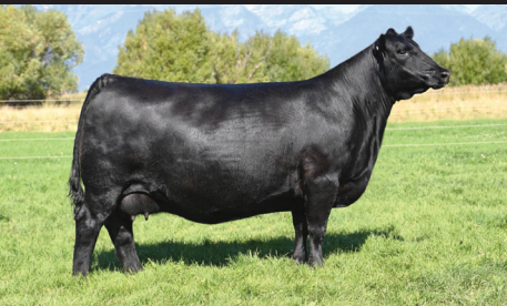
Bar-E-L Bride 28C Dam of Embryos