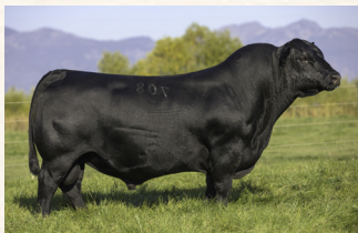
Coleman Resource 708 Sire of Embryos

She has been a standout since birth. 1439 has done a very nice job on her first two calves, BR 2/98, NR 2/105, and YR 1/107. "1439" is extremely long, deep sided, extremely good feet, with a big hip in her. The combination of Rock 7200 and C815 has been one of the very best matings on C815. Flush brothers to "1439" were features in our 2023 bull sale and sold to registered operations in Idaho and Texas. The sire of these embryos, Coleman Resource 708, is a bull that reminds me of the early days when bulls proved themselves in the pasture one calf at a time, and everyone started calling them by their tattoo number. We bred him to a bunch of females and have been flushing him to our top donors. We watched 708 and his progeny since we sold 708 to Gaugler Angus in Montana. 708's dam is 10 years old, a fourth-generation donor here for us, and has perfect feet, a perfect udder, and is moderate and very maternal. 708 has perfect feet also, and his daughters have perfect feet and udders, are extremely fertile, and raise big calves and breed back early. These are IVF embryos (Trans Ova), and we are selling three embryos in this mating and guaranteeing one pregnancy. These embryos are exportable to Canada.