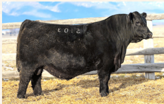
Coleman Authentic 5103 Sire of Embryos