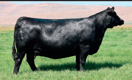
Coleman Chloe 1439 Dam of Embryos

Coleman Chloe1439 x Coleman Resource 708