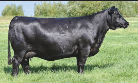
Coleman Donna 8216 Dam of Embryos