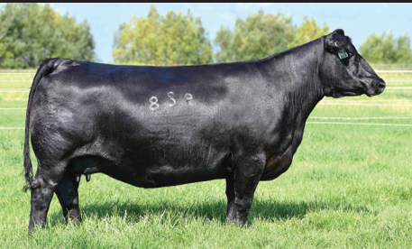
Coleman Donna 928 Dam of Embryos

Coleman Donna 928 x Coleman Avalanche 487