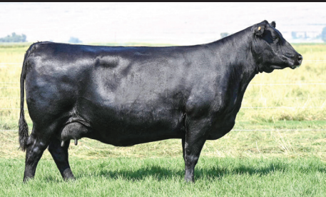
Coleman Donna 7231 Dam of Embryos

Coleman Donna 7231 x Coleman Charlo 0256