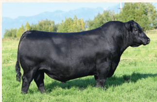
Hummel Palermo SA Sire of Embryos

8216 has a calving interval of 357 days on her first five calves and a progeny production record of BR 5/86, NR 5/110, and YR 5/106. 8216 is a visitor favorite and has been for a long time. She is a direct daughter of the Pathfinder sire, Coleman Charlo 0256, back to the Pathfinder dam, Coleman Donna 0308 who is a model Angus female that 16 currently 16 years old and has a herd bull at her side by Palermo. 8216 has a tremendous set of ET calves here this spring, and a female that we very rarely sell embryos out of. She has a perfect udder, long, deep, stout, and reminds me of her mother. Pay attention here!! Palermo is an outcross sire who has caught the attention of cattlemen around the world. He sold for $175,000 for 1/3rd interest in our 2024 Spring Bull Sale, for a valuation of $525,000. He has been a visitor favorite here the past couple of years, with many telling us, "He's as of a bull as we've seen in a long time." He is as impressive of a bull as you will find with Angus breed character, tremendous depth of body, perfect feet and structure with a huge, wide hip and muscle expression. Palermo sired two of the best bulls we have ever made here in Program and Authentic. His daughters