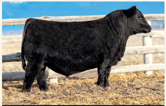
Coleman Program 593 Sire of Embryos

“9365” has a calving interval of 367 days on her first 3 calves, BR 4/91, NR 4/102, and YR 4/106. “9365” was a major highlight in our 2023 “Your Maternal Source Female Sale”. “9365” is a full brother to Glacier 041 in blood. She sold to Allen Brothers Cattle in OR for $100,000 valuation. 9365’s dam was a Pathfinder female here, and a flush sister to Donna 439. 9365 has a beautiful udder, great feet, tremendous mass, power, and performance. We are extremely excited to get ET calves on the ground out of her, we feel like she has a lot of potential. Coleman Program 593 is owned with Schaff Angus Valley of St. Anthony, ND, KT Ranches in Canada and Canadian Sires and Donors in Canada. Program is the $270,000 top-selling bull of the 2026 Coleman Angus Spring Bull Sale where he captivated cattlemen from all over the world. He is a son of the outcross sire, Palermo, back to the Pathfinder dam, Coleman Donna 787. He is as good as we have ever produced at Coleman Angus for phenotype, power, mass, structural correctness, body dimension, and has a flawless stride when in motion. We have not produced an individual that has this kind of three-dimensional shape from front to rear with as explosive of hip structure and width from behind. His Pathfinder dam has generated $1,687,000 on 27 head in past Coleman Angus sales. A full sister was the $150,000 valued second top-selling