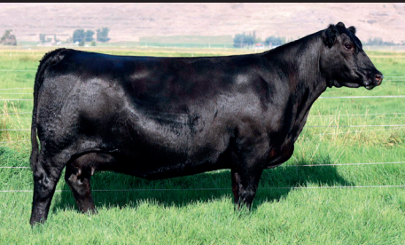
Coleman Echo 122 Dam of Embryos