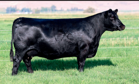
Coleman Donna 0177 Dam of Embryos

Coleman Donna 0177 x Coleman Program 593