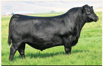
Coleman Banker 9215 Sire of Embryos