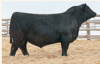
Coleman Maternal Balance3734 Sire of Embryos

Coleman Donna 9209 is a Pathfinder female. She records a progeny production record of BR 4/100, WR 4/116, and YR 4/115. Coleman Donna 9209 is the definition of Maternal. A daughter of Density 4336 back to the $60,000 Coleman Donna 6143. "9209" is one of the closest descendants we have going back to our original Donna female "J311". "9209" has a perfect udder, always raises one of our biggest calves at weaning. "9209" has bred first straw AI every year of her life, has excellent feet, and is a maternal sister to Coleman Donna 8284 the $32,500 one-half interest feature through our 2023 Your Maternal Source Sale. We do not sell many embryos out of 9209, so pay attention here. We have a great set of ET calves out of her this spring, and her natural calf is a stand-out again. Maternal Balance has created as much interest as any bull we have ever produced. He is as complete and fault-free as any bull you will find. He is big topped, massively hiped with added body in a perfectly structured skeleton, and stands on a perfect foot. We are very excited to get our first set of calves out of him. His Pathfinder dam is Coleman Chloe 9275, who is quickly making her mark as one of the best cows to ever walk here on the ranch. She has a progeny production record of BR 4/95, WR 4/116, and YR 3/122. Chloe 9275 is also the dam of Coleman Platinum, Coleman Security, Coleman Arrowhead, Coleman