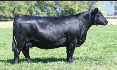
Coleman Donna 023 Dam of Embryos

Coleman Donna 023 x Coleman Authentic 5103