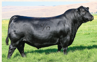
Coleman Glacier 041 Sire of Embryos

Coleman Donna 8146 is the all-time, record-selling female in Coleman Angus history, selling one-half interest for $375,000 for a $750,000 valuation to ZWT Ranch of Tennessee in the 2023 Your Maternal Source Female Sale. She has a progeny production record of BR 4/92, WR 4/109 and 3/109. Full sisters to 8146 include the $90,000 valued, Coleman Donna 4203, who in turn produced Coleman Banker 9215 who sold one-half interest for $75,000 for a $150,000 valuation through the 2020 Your Maternal Source Female Sale going to Voss Angus of Iowa. Another full sister of 8146 is Coleman Donna 8147, the granddam of Coleman Below Zero 2106, the featured GENEX Beef sire, who sold $150,000 for one-half interest for a $300,000 valuation. Coleman Glacier 041 is currently the #1 bull for $M in the whole breed that has daughters in production. Glacier will improve foot quality, udder quality, fertility, disposition, structure, while also being extremely sound, athletic, and possessing a great herd bull look. We feel he is the bull the industry has been looking for! His daughters here are as good as we have ever had the opportunity, to work with. We have 3 flush sisters to Glacier here at the Ranch and every one of them is Pathfinders: they have, perfect udders, great feet and are stout with a beautiful look. Every one of these sisters has a great production, record, perfect calving