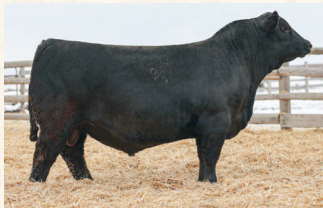
Coleman Maternal Balance3734 Sire of Embryos