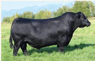
Hummel Palermo SA Sire of Embryos

Coleman Donna 8146 is the all-time, record-selling female in Coleman Angus history, selling one-half interest for $375,000 for a $750,000 valuation to ZWT Ranch of Tennessee in the 2023 Your Maternal Source Female Sale. She has a progeny production record of BR 4/92, WR 4/109 and 3/109. Full sisters to 8146 include the $90,000 valued, Coleman Donna 4203, who in turn produced Coleman Banker 9215 who sold one-half interest for $75,000 for a $150,000 valuation through the 2020 Your Maternal Source Female Sale going to Voss Angus of Iowa. Another full sister of 8146 is Coleman Donna 8147, the granddam of Coleman Below Zero 2106, the featured GENEX Beef sire, who sold $150,000 for one-half interest for a $300,000 valuation. Palermo is an outcross sire who has caught the attention of cattlemen around the world. He sold for $175,000 for 1/3rd interest in our 2024 Spring Bull Sale, for a valuation of $525,000. He has been a visitor favorite here the past couple of years, with many telling us, "He is as of a bull as we have seen in a long time." He is as impressive of a bull as you will find with Angus breed character, tremendous depth of body, perfect feet and structure